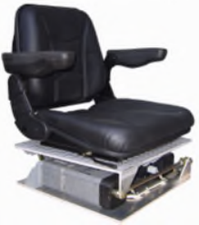
Low Profile Motion Seat System