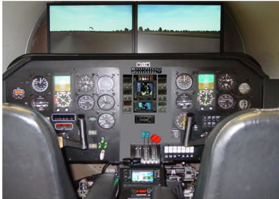
AST 3000 Retrofit option 3 with the most popular option $64.150